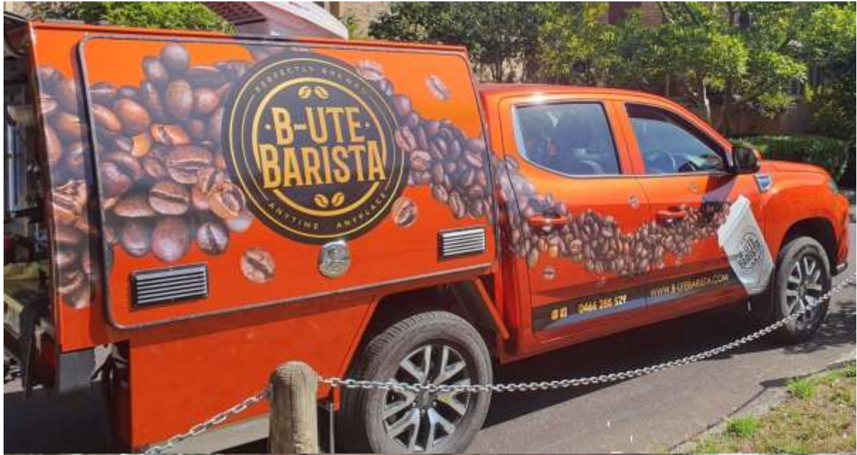
Coffee Cart last Sunday